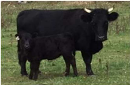
Legacy Jams Tuatha Jitsy – Dwarf Cow