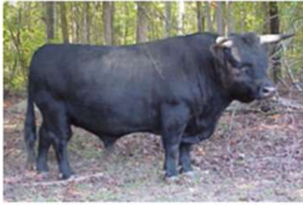
Brenn of Paradise – Dwarf Bull