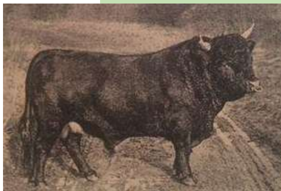
Bottom: IM18 Paradox Born Feb, 1884 First Royal Dublin Herd book