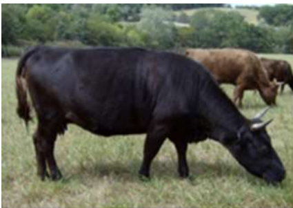
Legacy Blue Tully – Non-dwarf Cow

1. The Dexter is essentially both a milk-producing and a beef making breed, and both these points should, in judging, be taken into consideration.