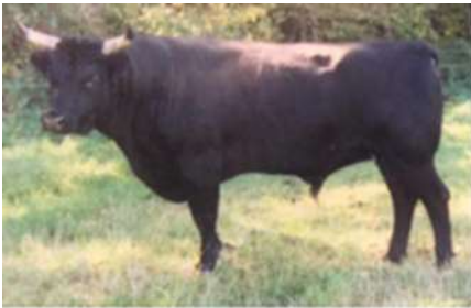
Lochinvar – Non-dwarf Bull